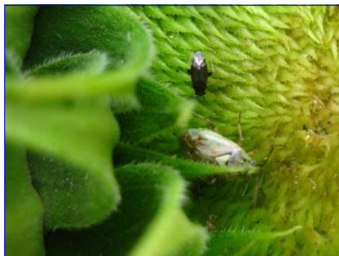
Fig 2. Top: Ragweed Plant Bug (not known to be economical) Bottom: Lygus Bug