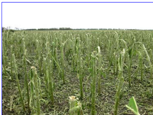
Fig. 1 All that is left of a Sunflower field SW of Morden after a severe hail storm on July 12.