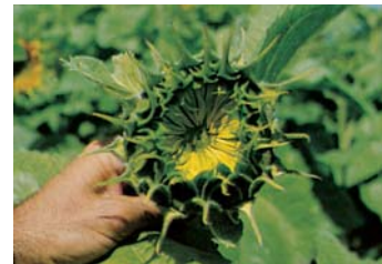
R-4 Top View