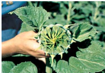
R-3 Top View