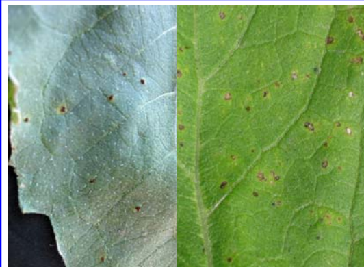
Fig 3. Left: Rust Pustules. Right: Necrotic (dead tissue) spots.