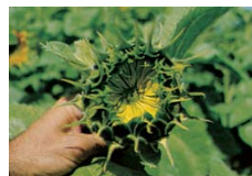
R-4 Top View