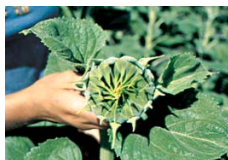
R-3 Top View