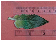
True leaf — 4 cm